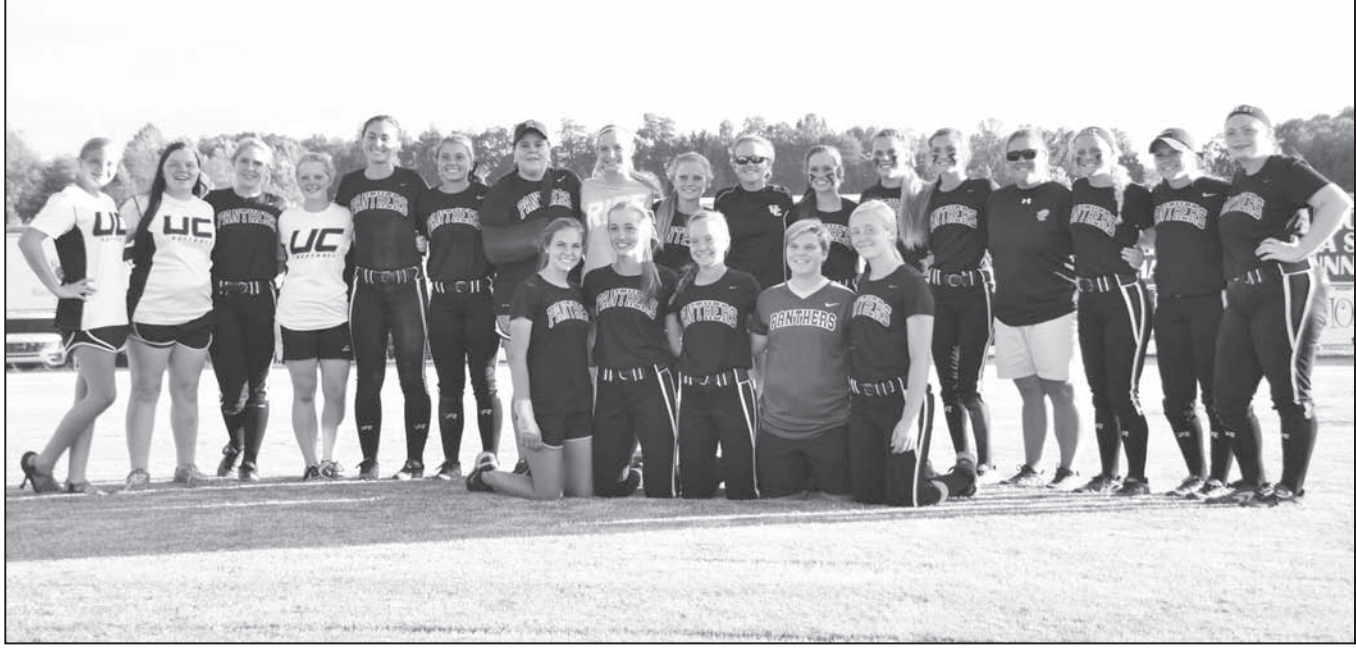
Union County softball reached the Sweet 16 for the third consecutive season and just missed out on back-to-back trips to the Elite 8 after dropping a pair of extra inning games at Southeast Bulloch with a spot in Columbus on the line.